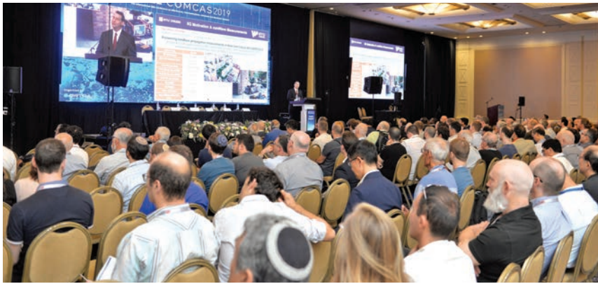
Figure 4. Prof. Ted Rappaport [New York University (NYU) and NYU Wireless] gives the keynote lecture “Wireless Beyond 100 GHz: Opportunities and Challenges for 6G and Beyond” at the opening plenary session. More than 1,900 attendees from 39 countries participated in IEEE COMCAS 2019 in Tel Aviv.