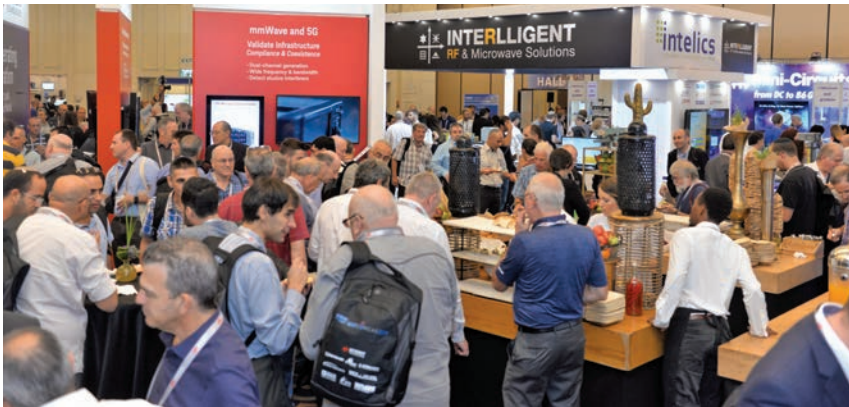
Figure 1. Participants enjoying refreshments at the large conference exhibition (100 booths).

Session topics at IEEE COMCAS 2019 included radar and microwave