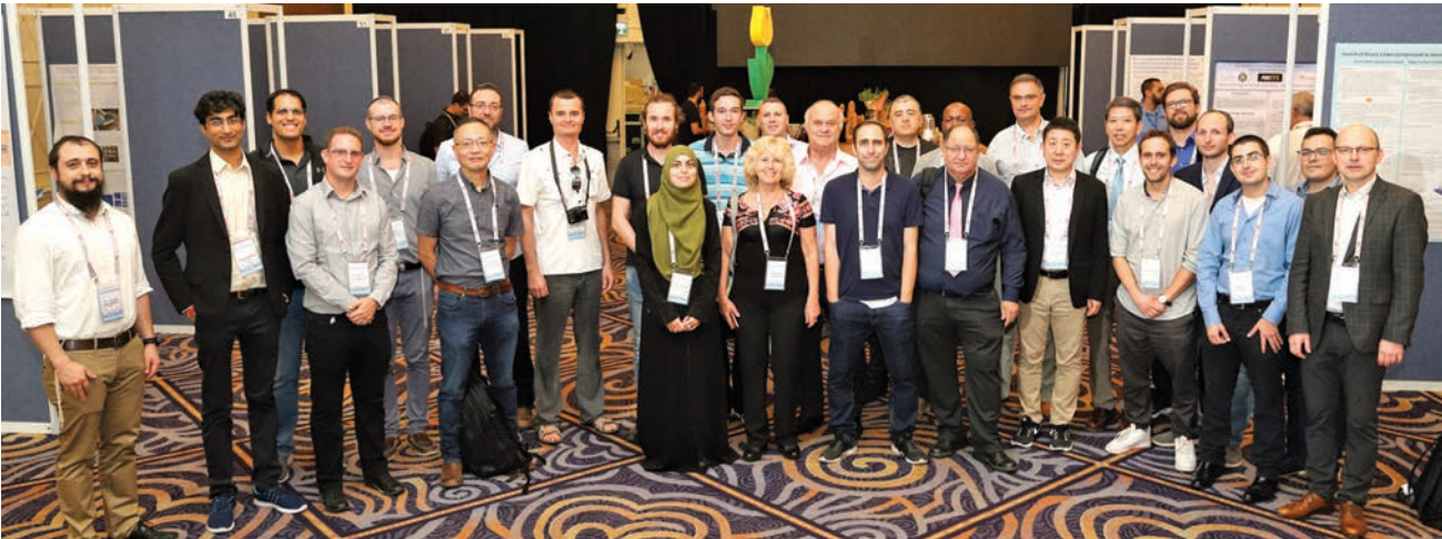
Figure 5. The poster presenters at IEEE COMCAS 2019 in Tel Aviv.