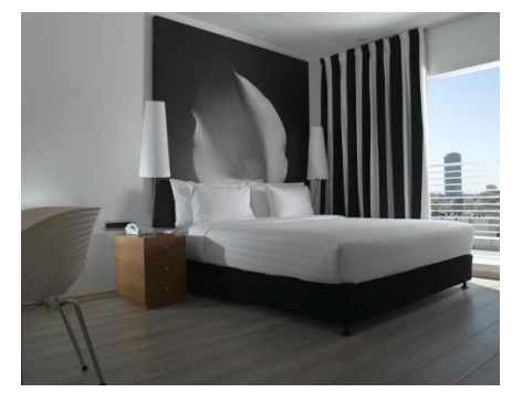
The Savoy Tel-Aviv I Sea Side: 5 Geula St. Tel-Aviv