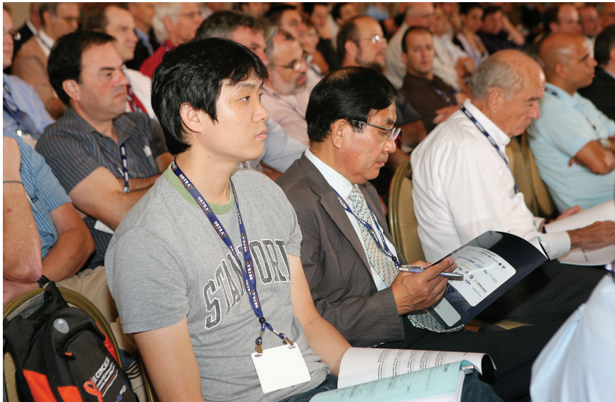
Nine hundred scientists and engineers from more than 28 countries attended COMCAS 2009.