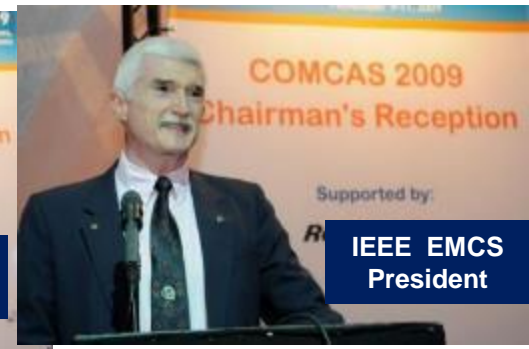
IEEE EMCS President