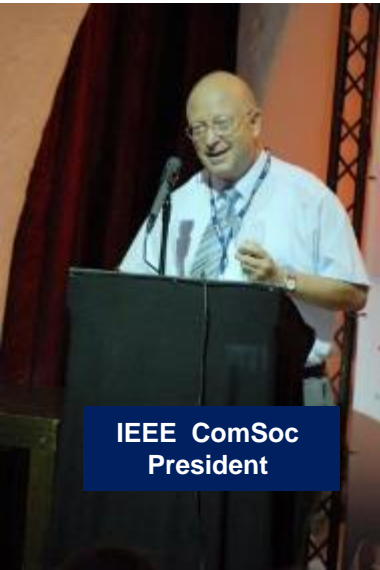
IEEE ComSoc President