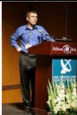
Pictures from COMCAS 2008