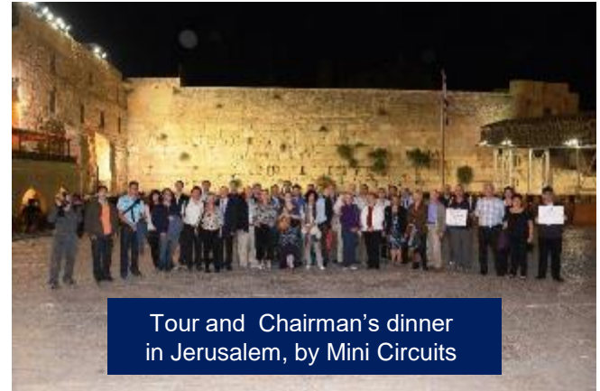
Tour and Chairman's dinner in Jerusalem, by Mini Circuits