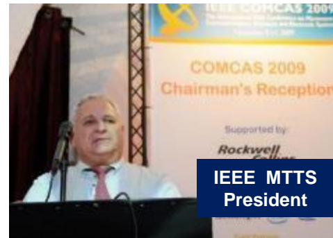
IEEE MTS President