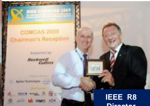
IEEE R8 Director