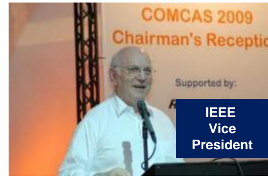
IEEE Vice President