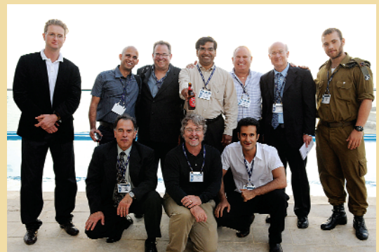
Colleagues and friends at the COMCAS reception.