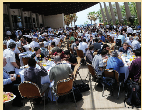
Group lunch on the Mediterranean coast.